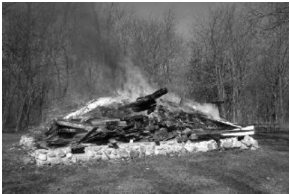
The last burning pieces and final clean-up.

Samples of the log walls – including a corner showing the log joints – plus wooden pegs, siding and square nails were salvaged from the badly burned structure. Park staff was burdened with the clean-up and on April 1 st and 2 nd , the remaining walls were pushed in and burned so that the site could be made safe for visitors.