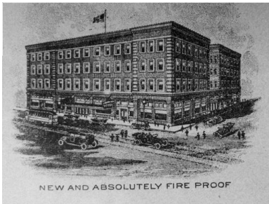
The Sheldon-Munn hotel opened in 1916 and was the showplace of Ames. The original blueprints are in the collection of the Ames Historical Society.

The mission of the Ames Historical Society is to preserve local history and illuminate its stories.